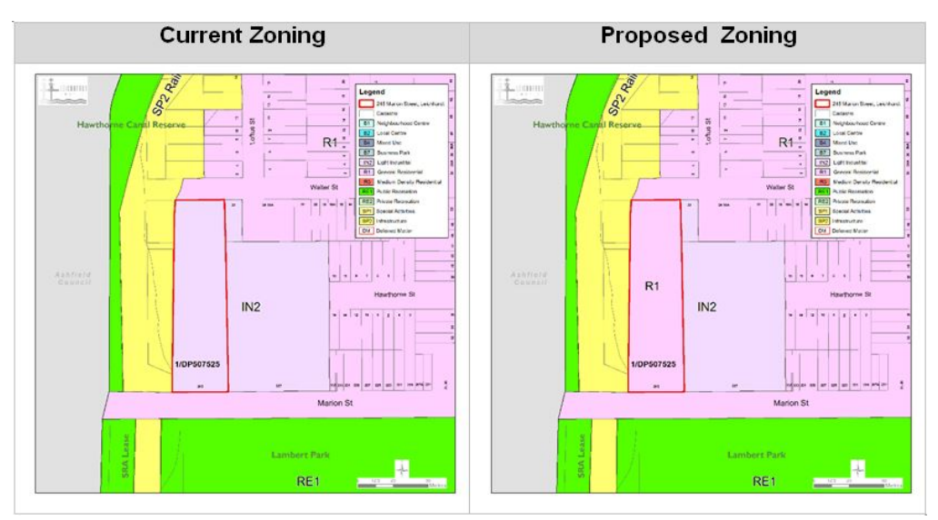
Figure 2 Zoning under Leichhardt Local Environmental Plan 2013